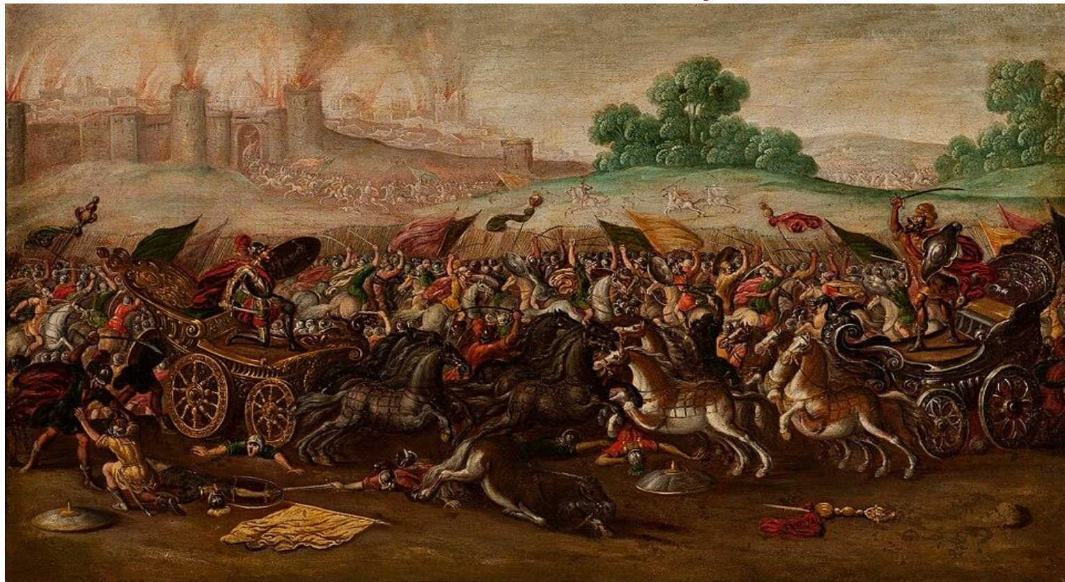
The Burning of Jerusalem by Nebuchadnezzar's Army, Circle of Juan dela Corte, c. 1630-1660, oil on canvas.

27 TH SUNDAY IN ORDINARY TIME C | OCTOBER 5, 2025