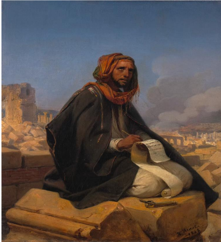
Horace Vernet, Jeremiah on the Ruins of Jerusalem, c. 1844, Amsterdam Museum.